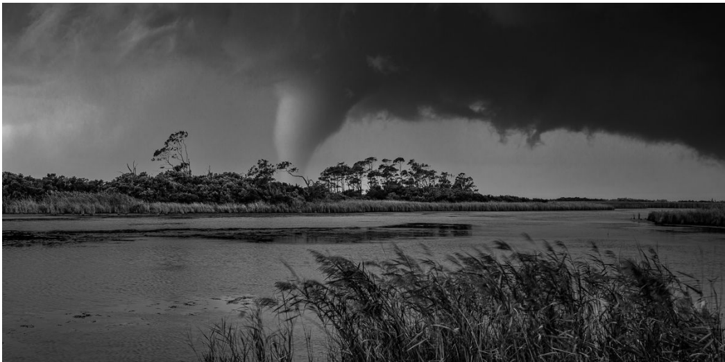
HM: “Twister” By Goutam Sen