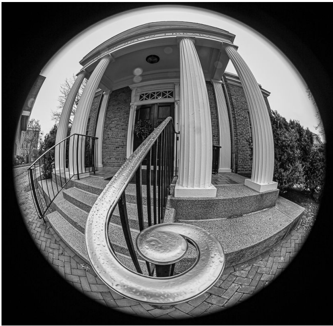
HM: “Not a Bank” By Doug Wolters

This image was taken during a break between the rehearsal and performance at a college in Northern Virginia – I forget its name! The building looks somewhat like a small bank, hence the title of the photo. Taken with a Canon 5D Mark III, Canon 8-15mm f/4L fisheye lens, 1/60 sec at f / 5.6, ISO 320.